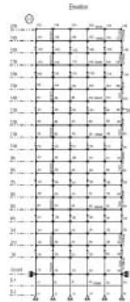
Figure 2. Schematic of 20-story benchmark building